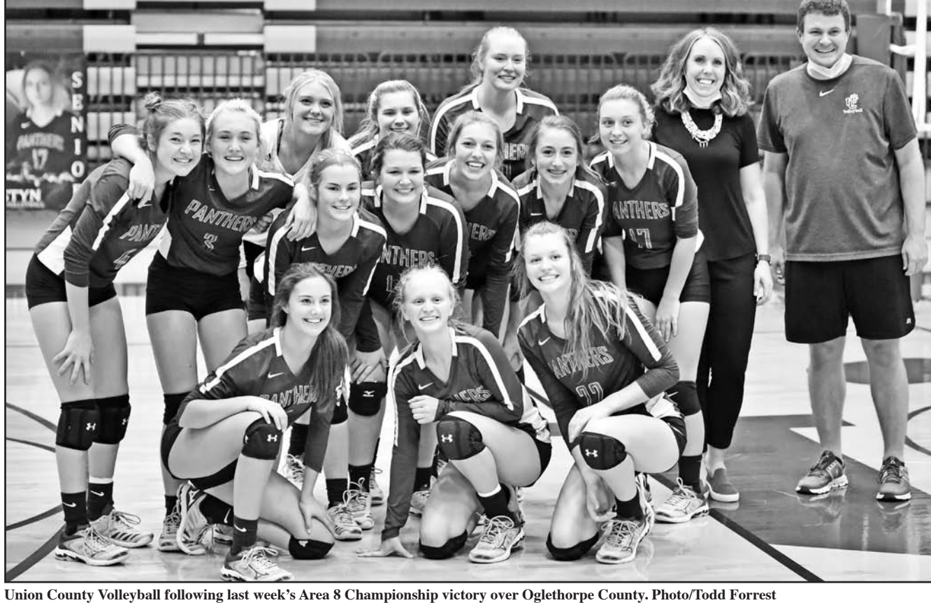
would belong to Union as they

Leading 18-10, the Panthers held off a late rally that pulled Oglethorpe within three at 19-16. But the final six points